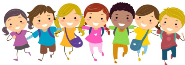
The importance of Attendance – what the percentages mean halfway through the year